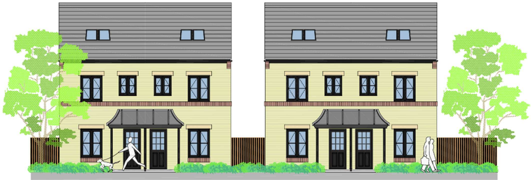
STREET SCENE ELEVATION TO BATH ROAD